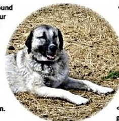
Berger d'Anatolie

☞ If you come face to face with a livestock guarding dog, behave calmly and passively in order to reassure him. If you are intimidated, slowly turn away from the dog.