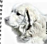
Pyrenean Mountain Dog

The livestock guarding dogs are not trained to attack but to deter: their stoutness and barking keep predators at bay. Once they sense danger, the livestock guarding dogs instinctively deter predators by placing themselves between their charges and any intruder. They also alert nearby shepherds to any disturbance. If the intruder does not take into account, they can then go up to the confrontation.